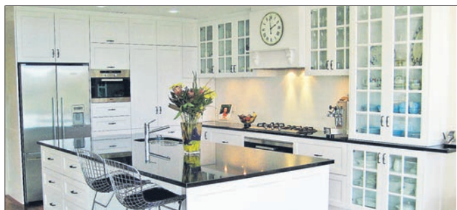
Chief investment: Kitchens are often the heart of family life.